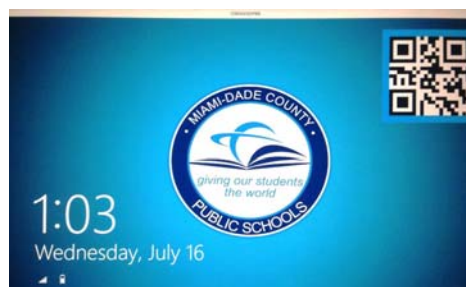
Figure 2: Home Screen with QR Code and Seal

Student mobile devices have been configured to lock if unauthorized users attempt to hack into the device. Attempts to use the device without the proper password authorization will render it unusable, locking all software applications and operating system.